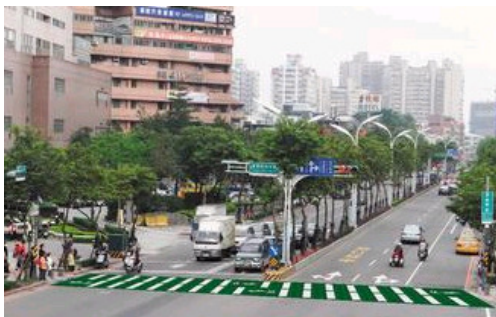
Crossing in Taipei

This project is part of Evonik's latest corporate responsibility activities in China, which were initiated in response to the United Nation's "Decade of Action for Road Safety 2011-2020", a campaign to stabilize and reduce road deaths. Together with its partners, Evonik plans to voluntarily apply colored crosswalks in more cities in China, focusing around primary and secondary schools or dangerous traffic zones. Since 2011, Evonik has marked zebra crossings in front of the Gong Chang Lu Primary School in the city of Wuzhou, Guangxi, and three primary schools in Chongqing, winning itself positive social feedback.