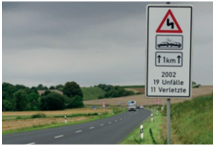
Before: poor marking – accident hot spot